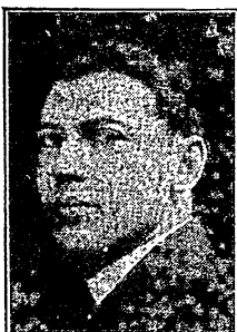
H. A. SHARK

The woolens are the best that can be secured. They are bought of Eastern woolen houses who sell only to high-grade tailors. The claim of Sharkcraft of its right to dress you up rather than the garments of other high-grade tailors is "in the making."